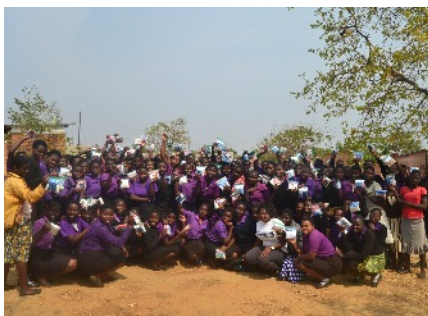
Reusable Sanitary Pad Donation