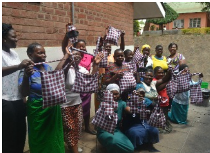
Former fistula patients - Malawi