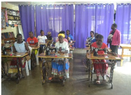
Reusable Sanitary Pad Training