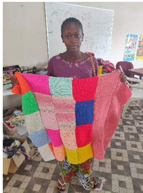
Yealie - Sierra Leone